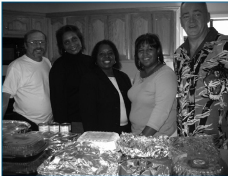
The Jackson County Missouri Chapter of The Links, Inc. cooked for SAVE Home residents.