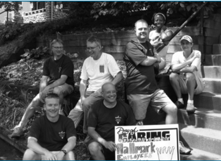
Hallmark Day of Caring volunteers and SAVE staff after a day of landscaping.