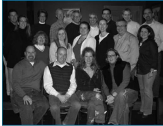
SAVE Inc. Board of Directors and management staff at January 2007 retreat.