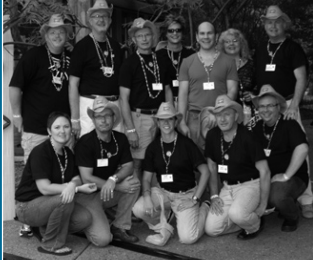
Corroboree 13 Steering Committee