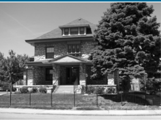
Mitchell House, administrative office for SAVE Inc.

This past year we marked our 20th anniversary of providing high quality housing services that have been recognized for excellence in affordable housing. We launched a comprehensive strategic plan process, which will conclude in the summer of 2007. With this plan we will have a thoughtful roadmap for the future. ■